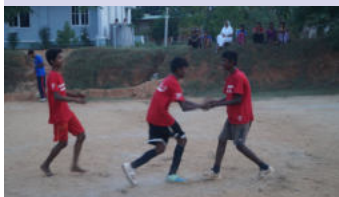
Joy of Winning