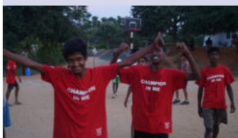
Winners of Futsal 2018