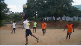
Ball in Air

“ We are short but strong enough to play because we have more stamina ”