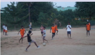
Futsal 2nd Round

“ We are short but strong enough to play because we have more stamina ”